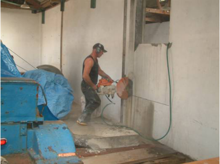
Cutting doorway for Heritage Centre access ramp

The Trust's intent to establish a Heritage Centre in the Quartermaster's Store is with DOC, the Historic Places and the Council's agreement well underway. A doorway has been cut between the two levels and an access ramp installed. A partition wall is under construction and another access ramp to the display area's store will follow. Planning is in hand to display the Trust's extensive collection of artefacts in a modern and engaging manner. Consultation is beginning with a number of parties to flesh out the design work.