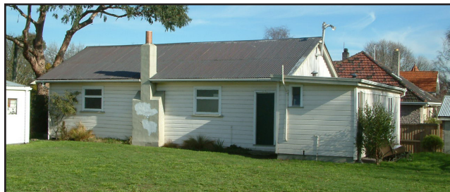
WW2 Barrack Block

The trust is in discussion with the current owners of one of the few World War Two barrack blocks still in tact and in the Christchurch area. The building is reported to have come from Godley