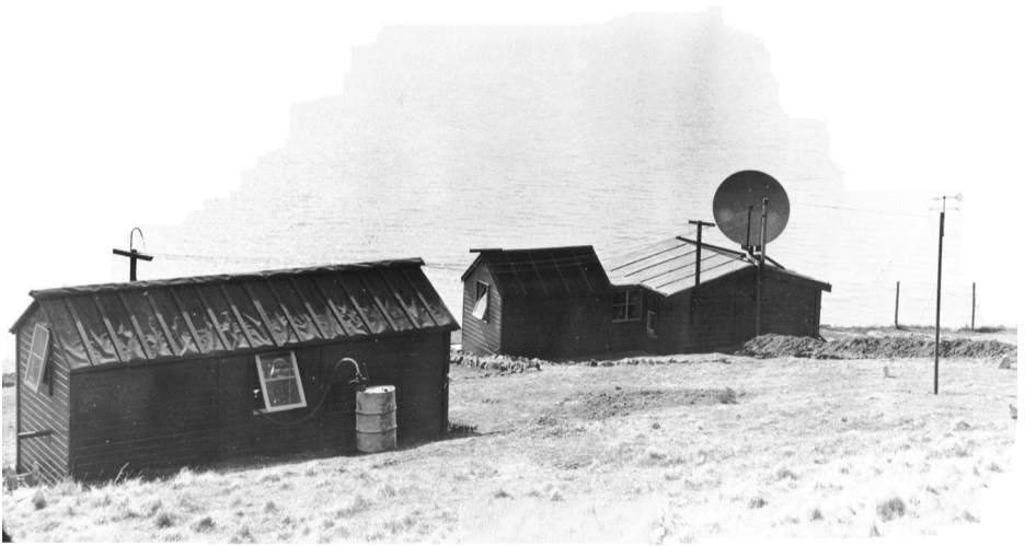
Port War Signal Station radar hut 1945